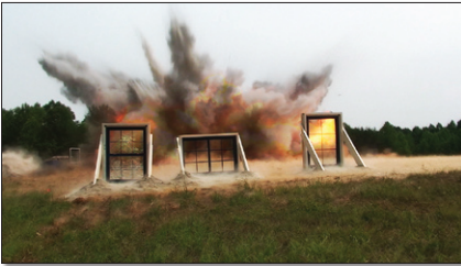
FPED VI, Quantico, V

Arena Testing is conducted with an actual explosive charge of specified weight, positioned at a predetermined standoff distance. This test produces both the positive and negative phase blast effects.