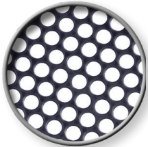
Perforated Steel Plating