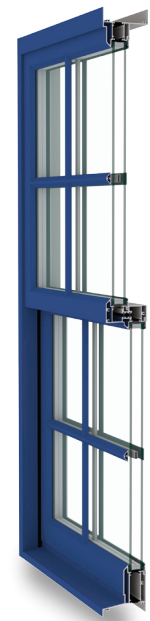
S1500 Offset Simulated Double Hung