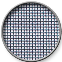
Standard Steel Mesh

Medium and heavy-duty security screens with your choice of steel mesh or perforated steel plating. Custodial and anti-burglar hardware options are available. Can be field or factory installed on windows.