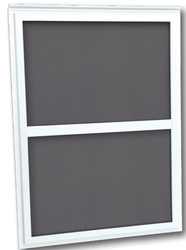
Top-Hinged Vandal Resistant Screen

The steel mesh features a 1/2", 90° bend at all edges to ensure tensile strength.