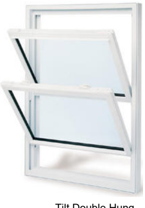
Tilt Double Hung